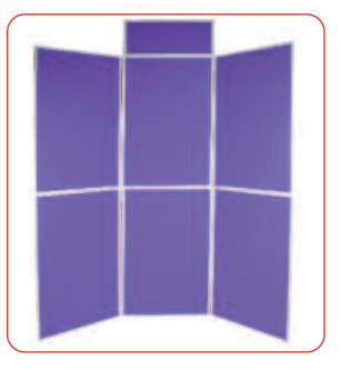
Fit header panel to the top centre hinged push downward to secure the connecting clips.