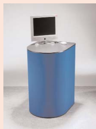
Single D Designed to add useful counter space to any display.