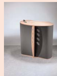
Elan Distinctive styling, Ideal workstation