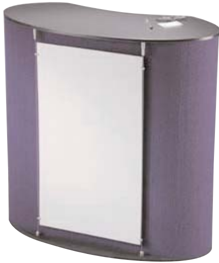
Graphic panel not included