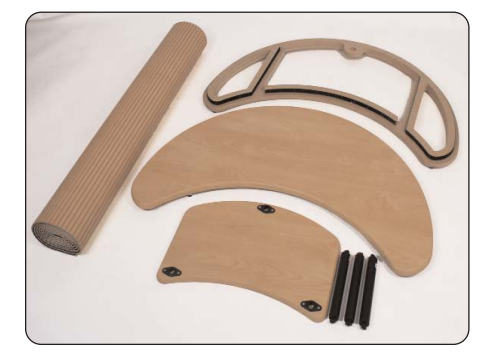
Kit includes: Top, base and MDF tambour wrap (Optional internal shelf and poles shown)