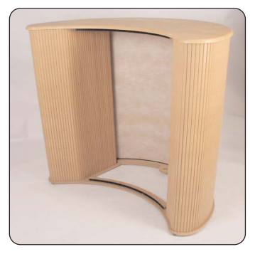
Completed Crescent workstation.