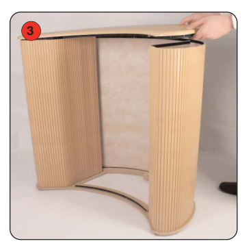
Place the top onto the wrap and secure using the hook fastener.