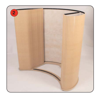
Continue to attach the wrap. At this stage you may decide to have the unit open or closed at the back.