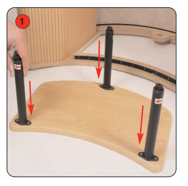
Locate the twist and lock poles into the internal shelf. Ensure the arrows on the poles are all facing the same direction.