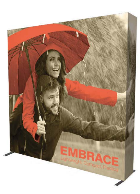
Important note: These instructions are based on assembling the 3x3m version. Other size kits will have slightly different configurations but can still be assembled in the same way.