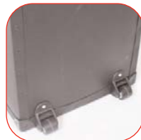
Wheeled for ease of use

NB - additional carry bags may be necessary depending upon kit/feet options, please refer to individual Linear kit user instructions for more detail