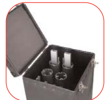
Insert holds components in place