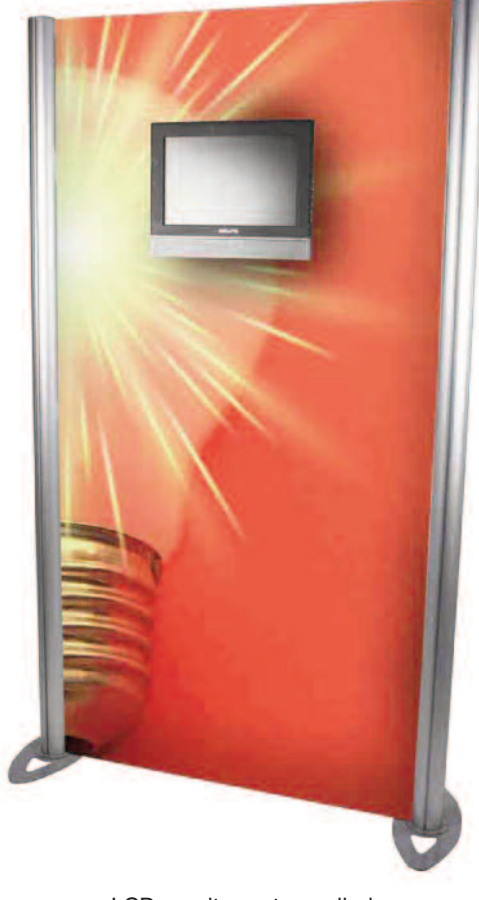
LCD monitor not supplied

This unique media stand allows you to merge your graphics with an audio visual message. The screen can be moved vertically and horizontally. An attention grabber for any exhibitions