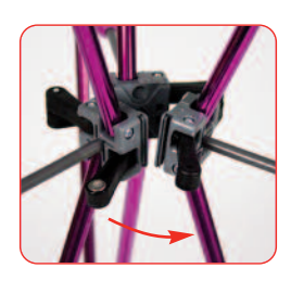
Fasten the sides together by closing each magnetic arm in the centre of the popup tower