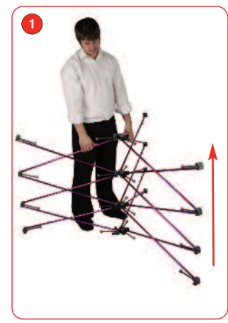
Lift the top of the pop-up frame to expand the structure ensure the nodes are at the top of the structure