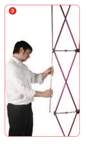
Attach the magnetic bars to the pop-up frame nodes