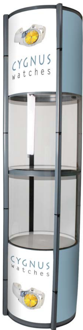
Spiral Tower (NB Graphics are not supplied)

Portable collapsible display cases that assemble in seconds without the need for tools.