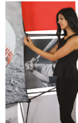
Repeat the operation for all graphics