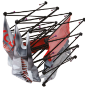
Deploy the structure