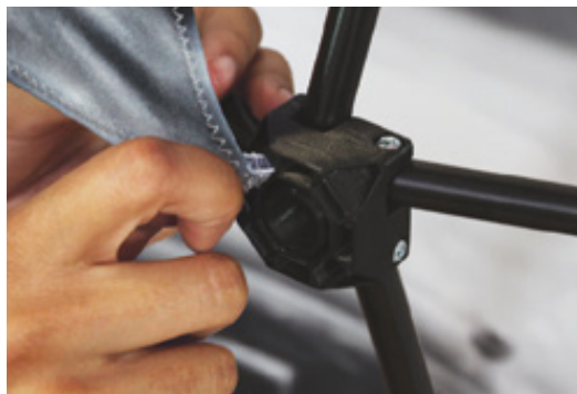
Insert the graphic into the fixation node