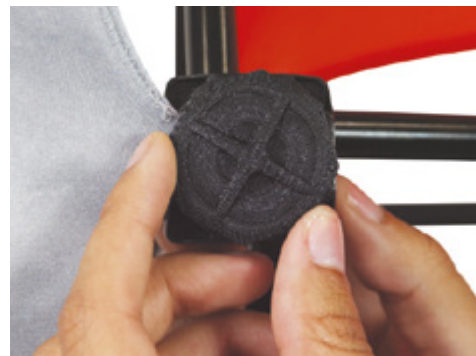
Adjust the piece to fix the graphic